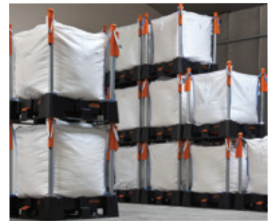
efficient stacked storage (max. 4 high x 1.500 kg.)