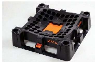
the bottom part of the Indus Neva with closed slide