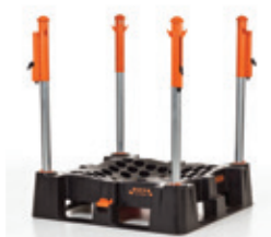
the complete Indus Neva System