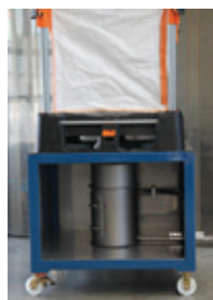
discharge and further conveying