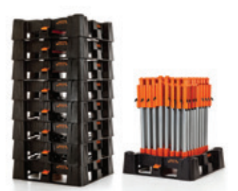
reduced volume if the systems are not in use

Improving your bulk storage and logistics