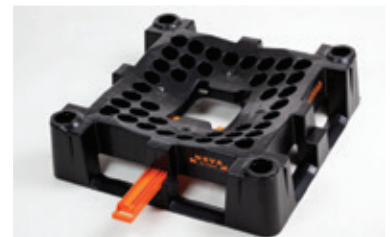
the bottom part of the Indus Neva with opened slide for (dosed) discharge