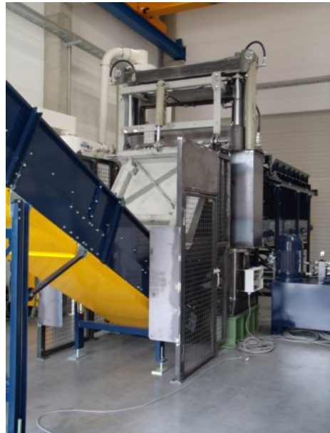
Guillotine Cutter GS 1500/1000, feed via a storage conveyor with suspended overhead pressing device; discharge via an inclined conveyor belt.

The complete unit is housed in a strong welded steel frame, consisting of a hydraulic System which activates several hydraulic cylinders. These cylinders move the horizontally mounted guillotine knife through the waste material cutting it against the Stator knife. The material that has been sliced by the guillotine knife is removed by the pressure on the Cutter. We have developed the NEUE HERBOLD Guillotine Cutter for the size reduction of problem waste. These materials maybe bales of fibre, tapes, multi-filaments, fish nets, entangled films, large lumps and bales of rubber. It is possible according to your specific needs to select a guillotine cutter with a hydraulic System suited for your material.