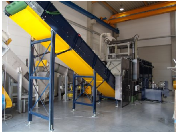
Guillotine Cutter GS 1500/1000, feed via a storage conveyor with suspended overhead pressing device; discharge via an inclined conveyor belt.